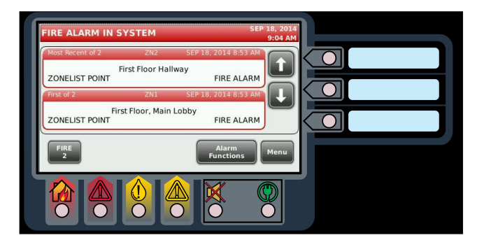
Figure 2: Touchscreen display with LED status indicators

Note: Seismically compliant under the State of California Statewide Office of Housing and Development (OSHPD) Special Seismic Certification (SSC) program guidelines. Refer to Simplex Seismic Application Guide 579-1213 and Battery Brackets for Seismic Activity Applications S2081-0019 for details.