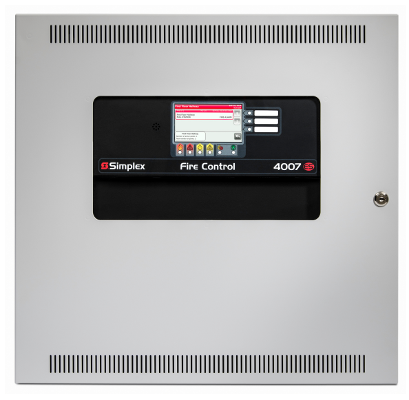
Figure 1: 4007ES FACU front view