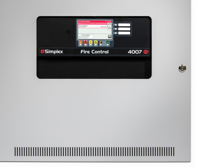
Figure 1: 4007ES Hybrid Unit front view